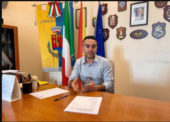
Filippo Mannino , The island's mayor of Lampedusa