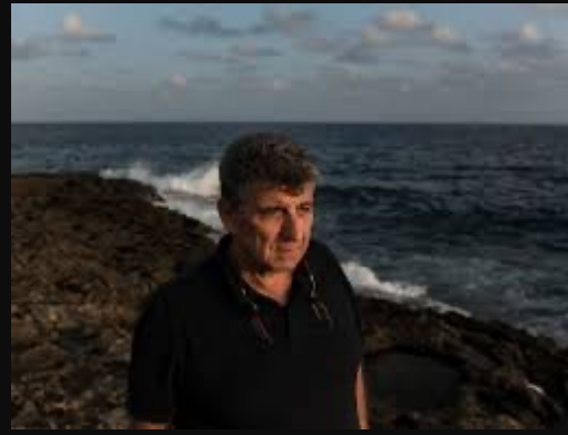
Pietro Bartolo , the doctor of Lampedusa

As a member of the European Parliament, the doctor of Lampedusa advocates for the rights of migrants and refugees, and fair migration policies globally. He provides medical aid to those arriving by sea.