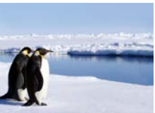
25. Pole To Pole