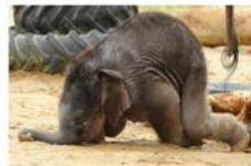
18. Incredibly Clumsy