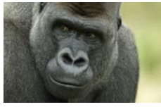
14. The Funniest Bosses