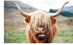
22. Really Quirky