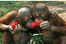
10. Cutest to make you smile