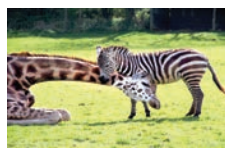
2. Friends For Life