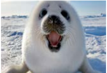
17. Cute and Cuter