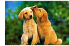
24. Puppy Love