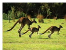
3. Bouncing Buddies