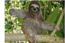
20. Weird And Wonderful