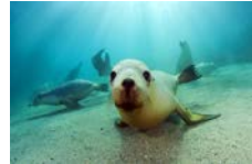
19. The Cute Flippers