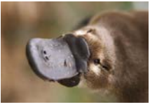
13. Cute But Dangerous