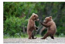
23. Memes & Jokes