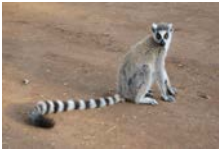
21. Tall Tails