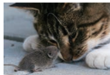
7. Cats & Mice