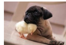
8. Sweetness & Sympathy