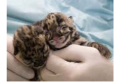
16. Zoo Births