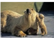
1. Cuddly Friends