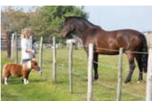
9. Small And Tall